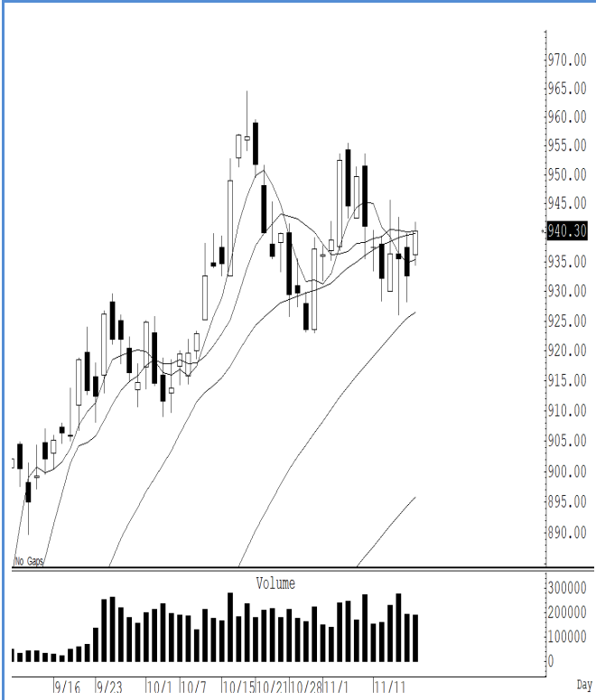
S50Z24 (Close 940.30 Chg -2.90)